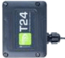
T24-BSue Wireless USB extended range base station