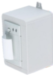
T24-PR1 Wireless surface mounting tally roll printer