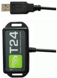
T24-BSu Wireless USB connected base station