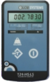
T24-HS-LS Simple wireless display for connecting to 1 load cell