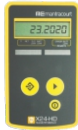
X24-HD ATEX Wireless display for connection to up to 24 load cells