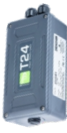
T24-SO Wireless serial ASCII output module