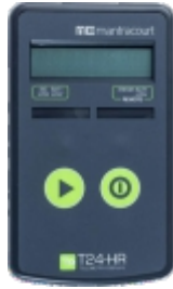
T24-HR Wireless display for connecting to multiple load cells