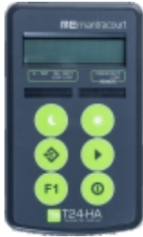
T24-HA Wireless display for connection to up to 12 load cells