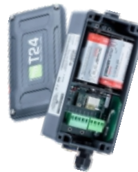
T24-AR Wireless range extender repeater module