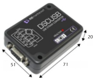
Converter cased version